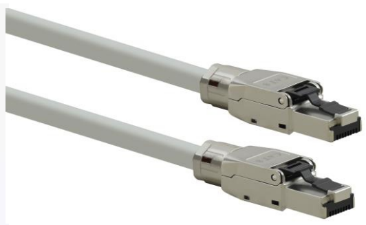
Cat 8.1 SFTP Patch cord